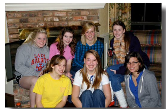
Lake Trip over Christmas